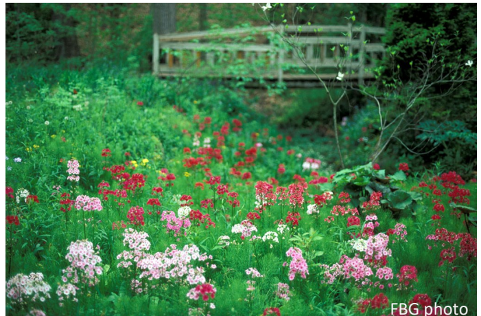
Fernwood Botanical Gardens Niles MI

Two clubs were awarded the Plant America Award. As a wrap-up for our District, things are going well, and much is already in the works for the next program year.