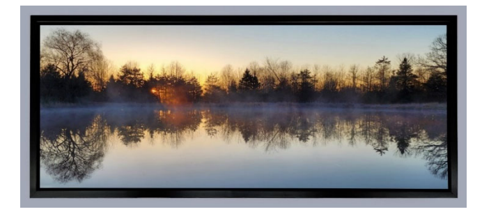
photo board with a white base layer and has a custom 5/8" wood black frame. The print dimensions are 10" x 24" plus frame. The overall depth of the frame is 1 inch, and it is ready to hang in your favorite location. Donated by Lynn O'Shaughnessy

This award-winning photograph is printed with UV inks for longevity, durability and fade resistance with a satin finish for reduced glare. It is printed on lightweight black