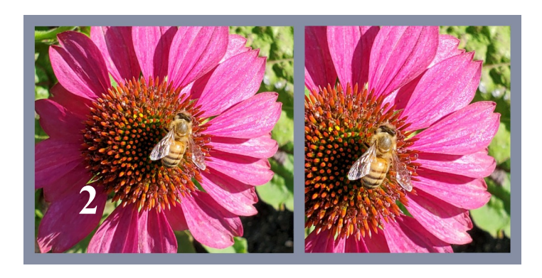
Continue on next page.