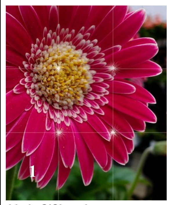
Linda O'Shaughnessy Photography Chairman

If you already took the photo and centered the subject, try cropping to position the subject at one of the intersections of the rule of thirds. You should have a free simple cropping tool on your phone, tablet or computer. In this example (2) both the before and after photos are shown. The bee is pretty much centered and the dark shadows of the petals on the left detract. By cropping, the photo is more interesting, and your eye focuses more on the bee, which is the main subject of this photo. Play with cropping and see what you think.